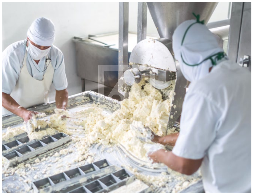
TroBloc® F hygienic wall cladding panels are suitable for use in numerous areas of application.