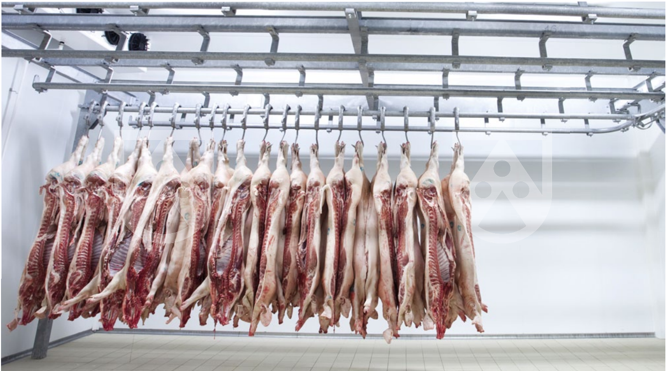
TroBloc® F Hygiene wall cladding panels enable with their easy-to-clean effect large surfaces to be cleaned quickly.